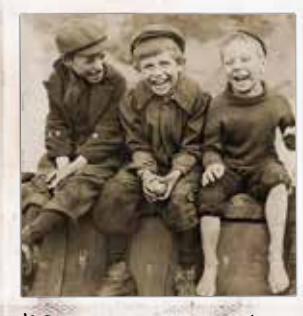
Me a my mates

Koro Chee Glaze | Pickled Cucumber & Red Onion | Chili Oil Sesame Seed | Fried Shallot | Chili Thread GF, DF