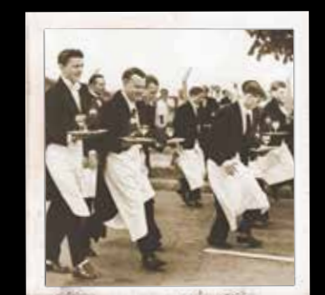
Not a drop spilled

Shiitake Mushroom & Tofu Dumplings | Laksa | Rice Noodle Fried Shallot | Prawn | Mussels | Market Fish | Sesame Seed DF