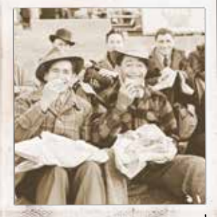
Fish a chips - ywn!